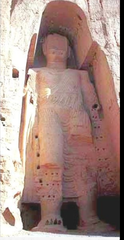
Undated photo of one of the Buddha statues in Bamiyan, Afghanistan, before its destruction in 2001.